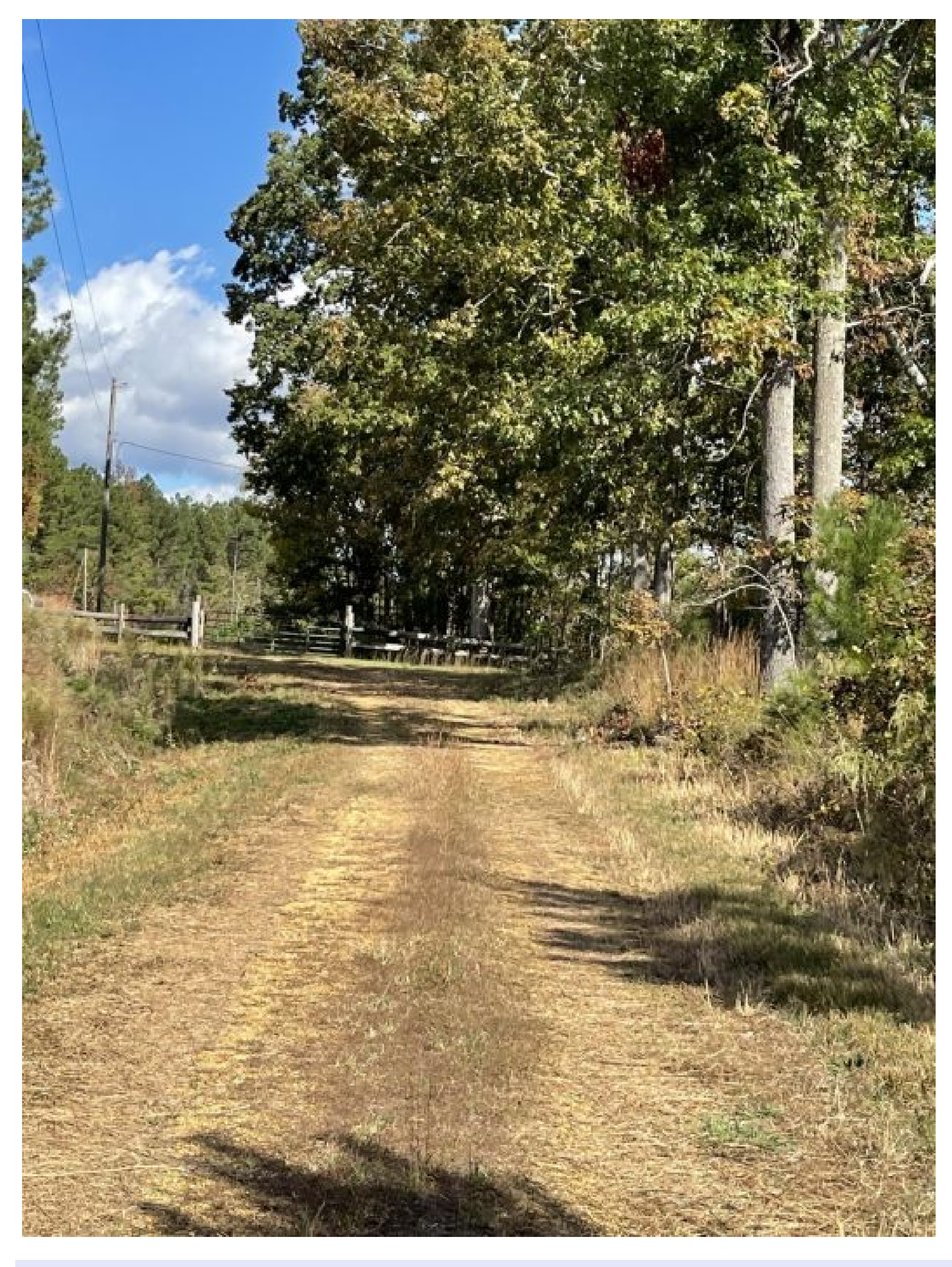
132.00 Acres Franklin County GPS 34.4031 X -87.9714