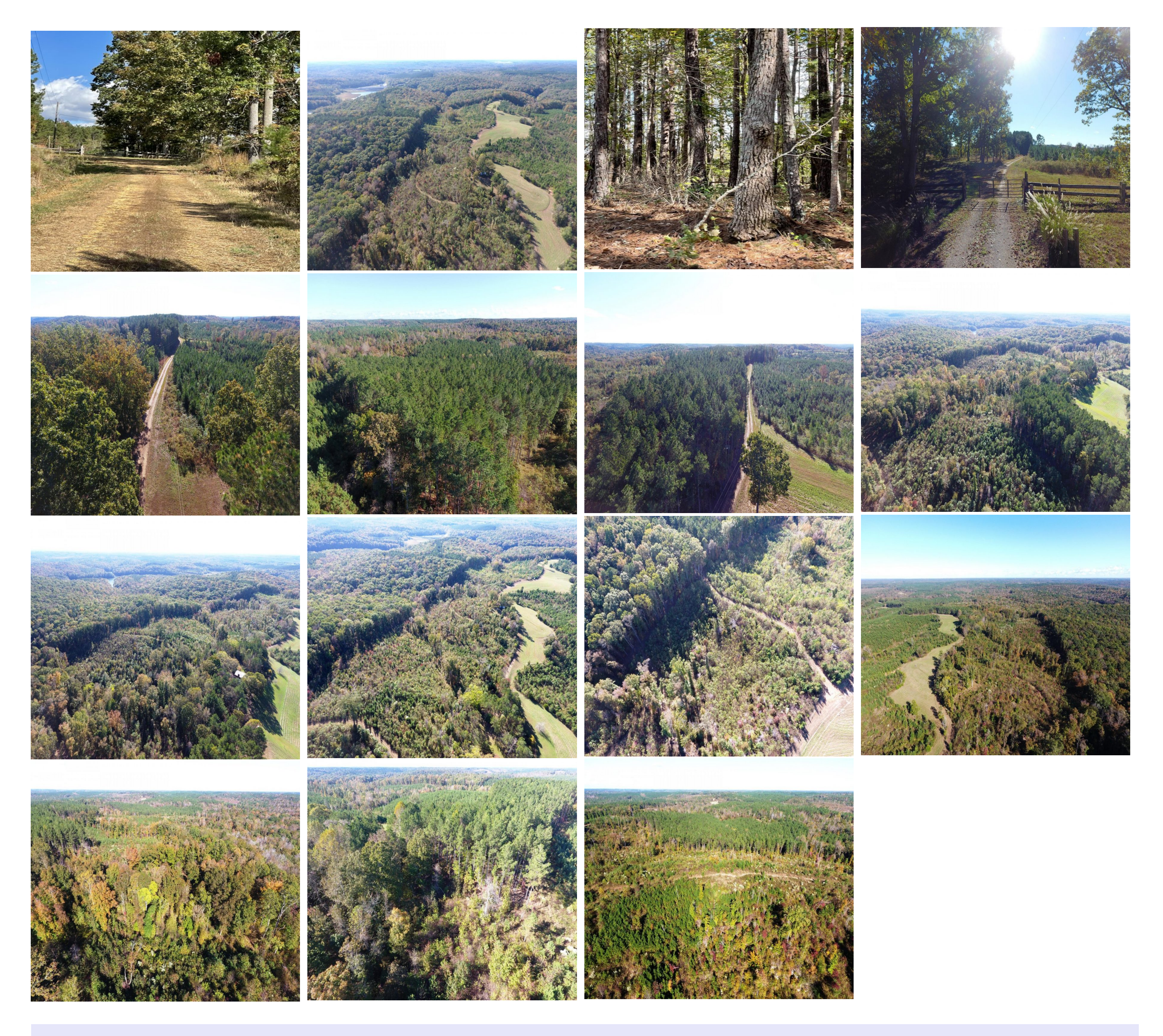
132.00 Acres Franklin County GPS 34.4031 X -87.9714