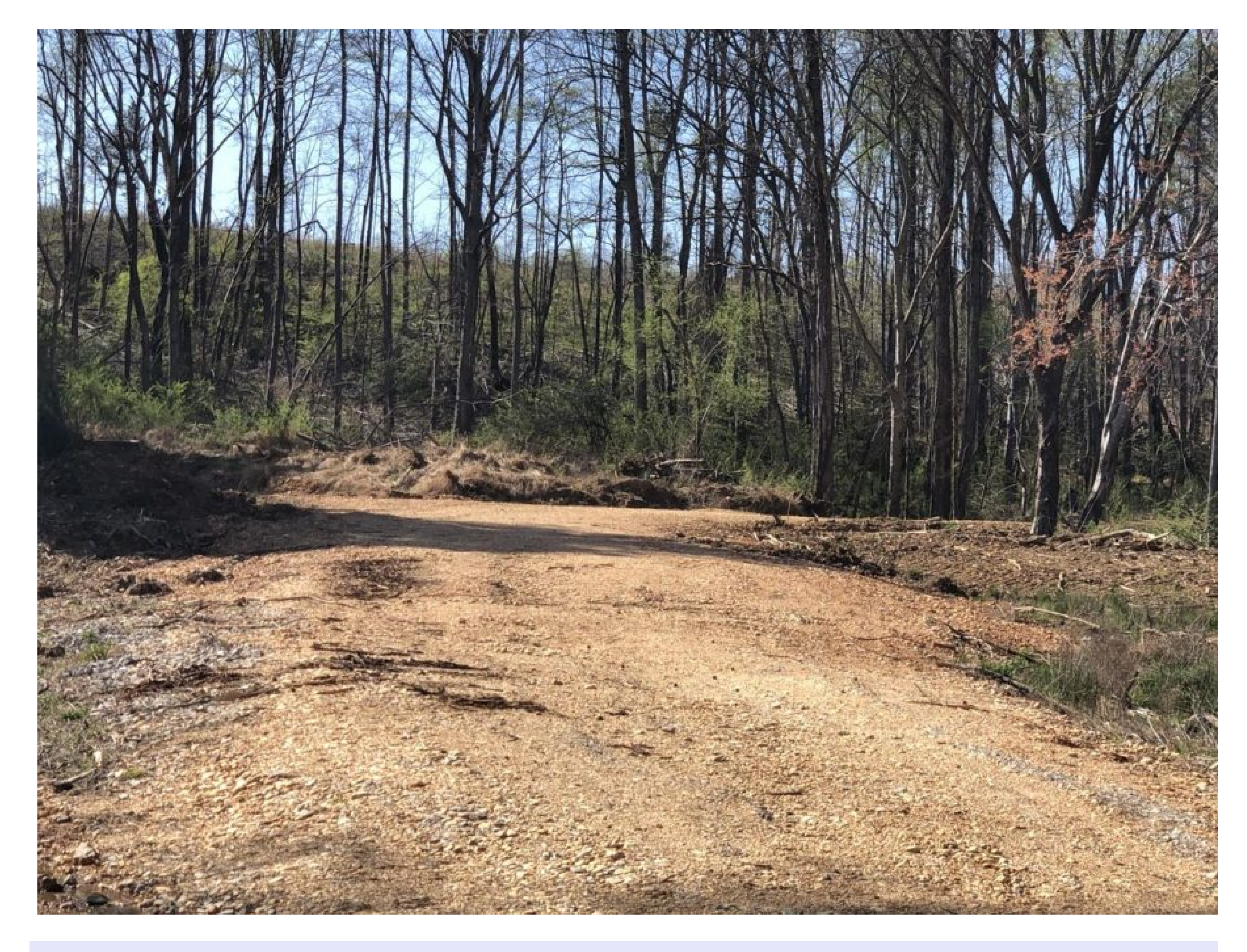
160.00 Acres Colbert County GPS 34.8361 X -87.9832