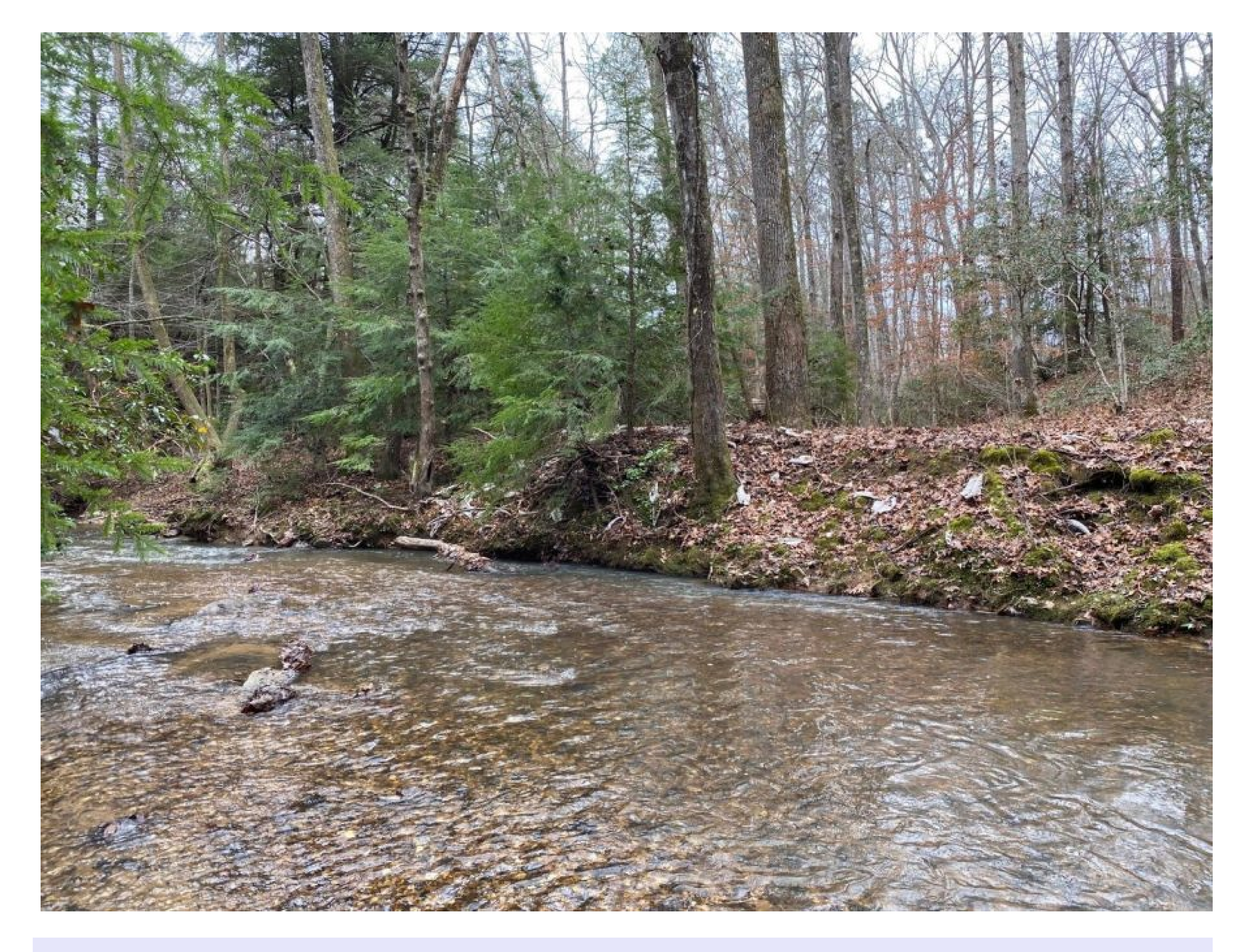
4.00 Acres Franklin County GPS 34.3689 X -87.7626