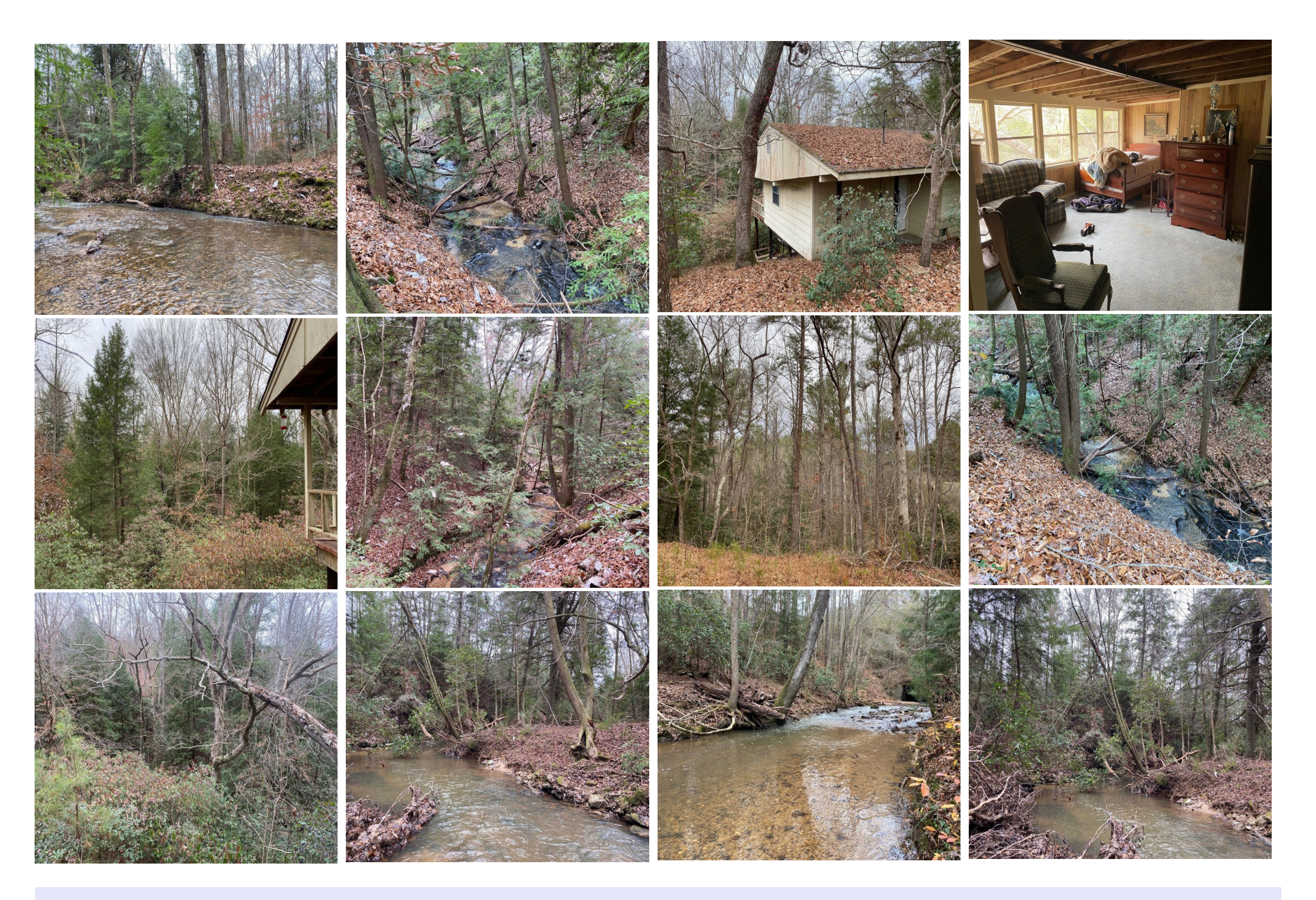
4.00 Acres Franklin County GPS 34.3689 X -87.7626