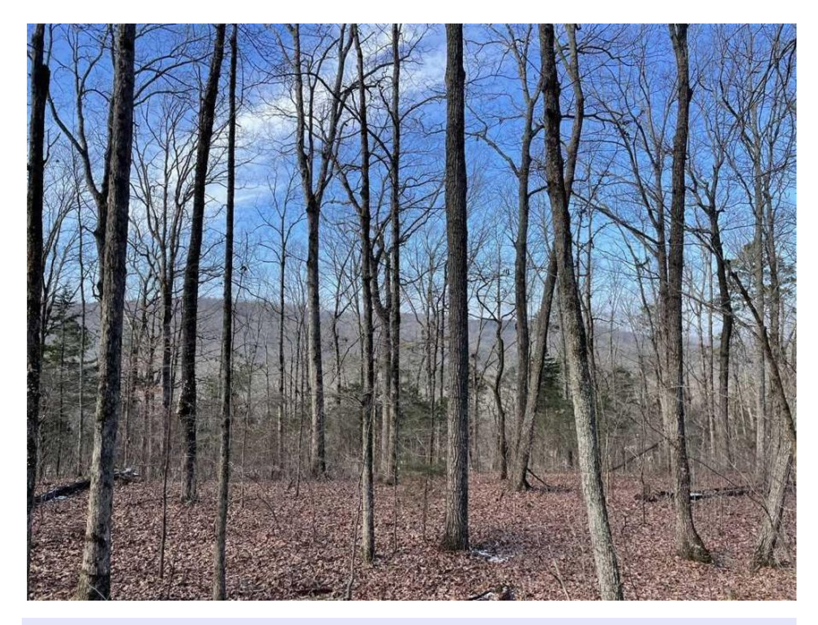
47.00 Acres Lawrence County GPS 34.4168 X -87.3015