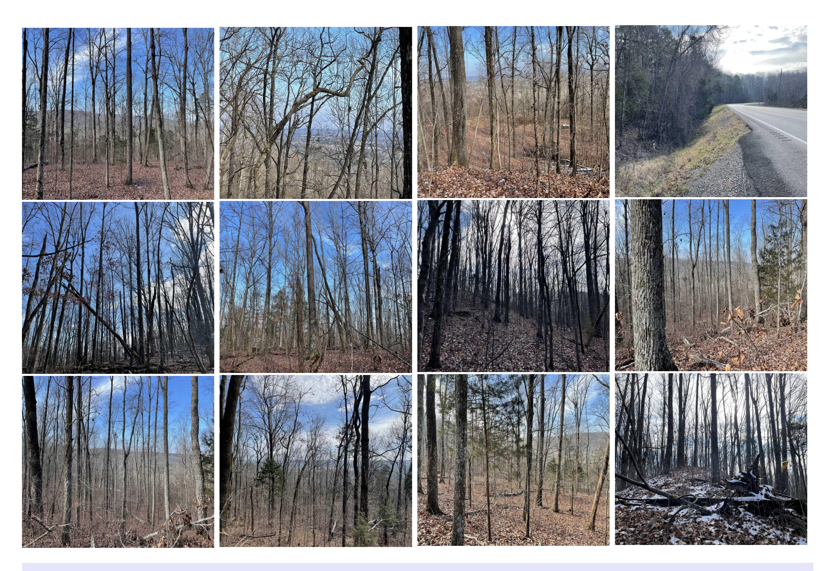
47.00 Acres Lawrence County GPS 34.4168 X -87.3015