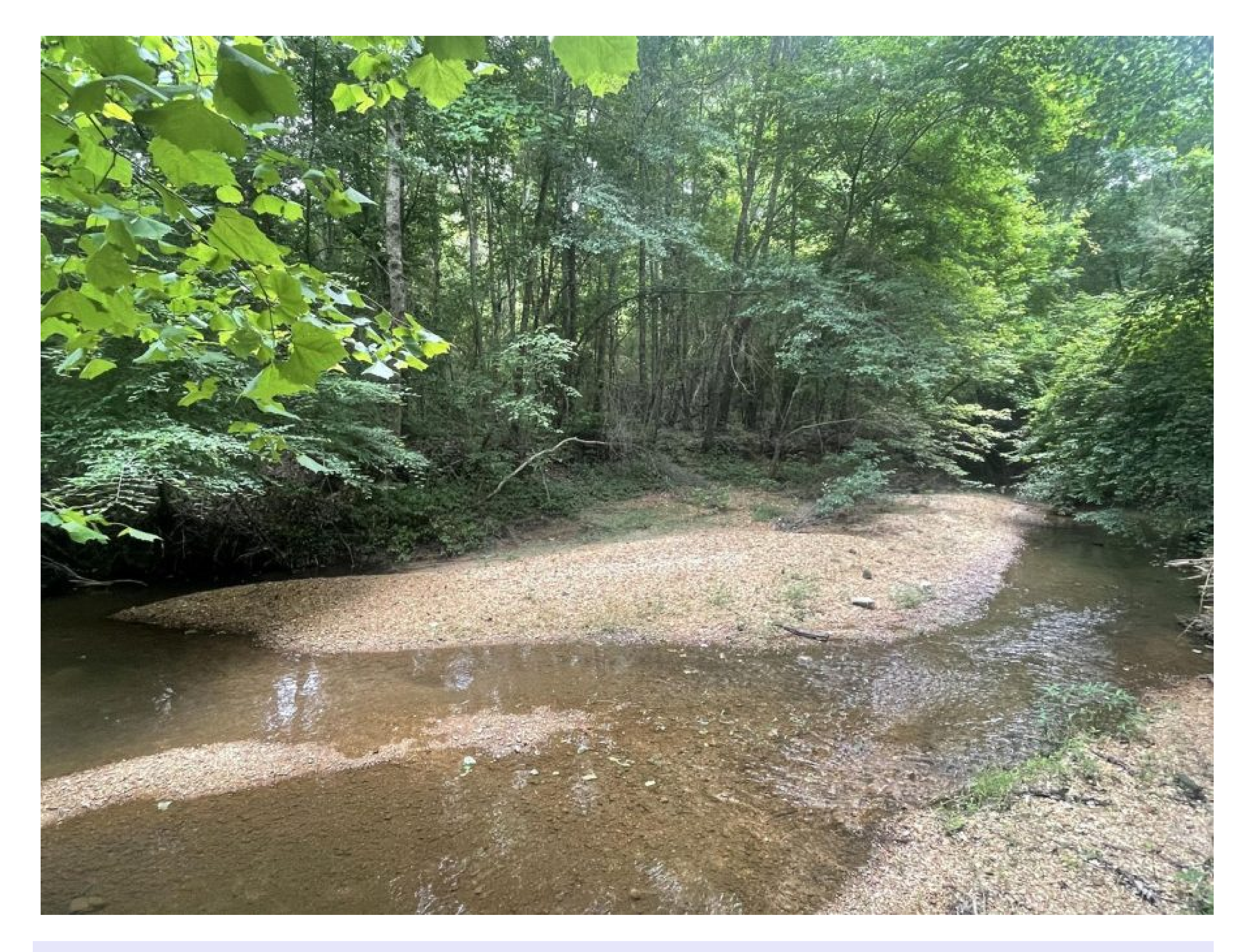
75.00 Acres Marion County GPS 34.1974 X -87.0671