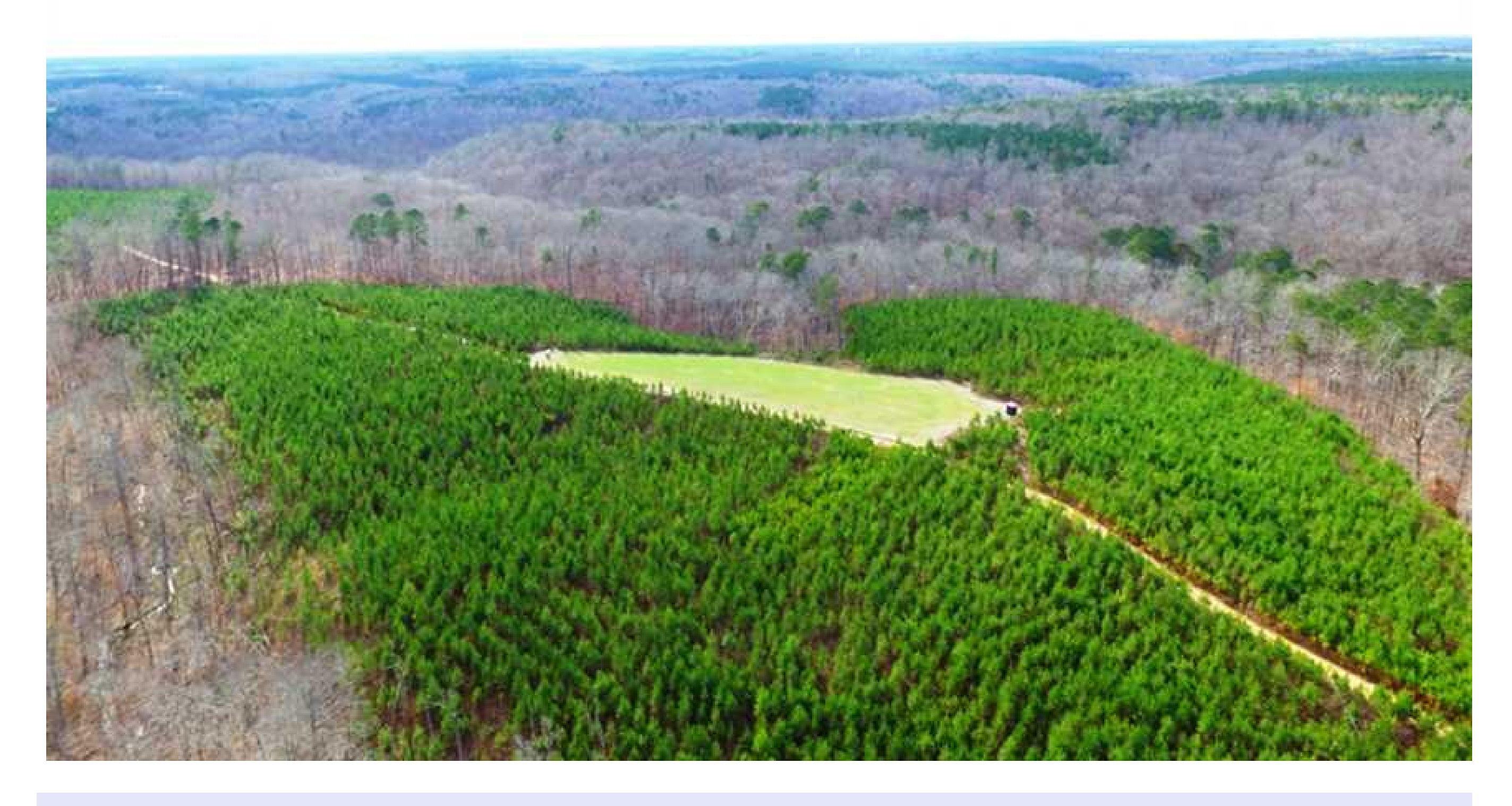
88.00 Acres Franklin County GPS 34.3914 X -87.5399