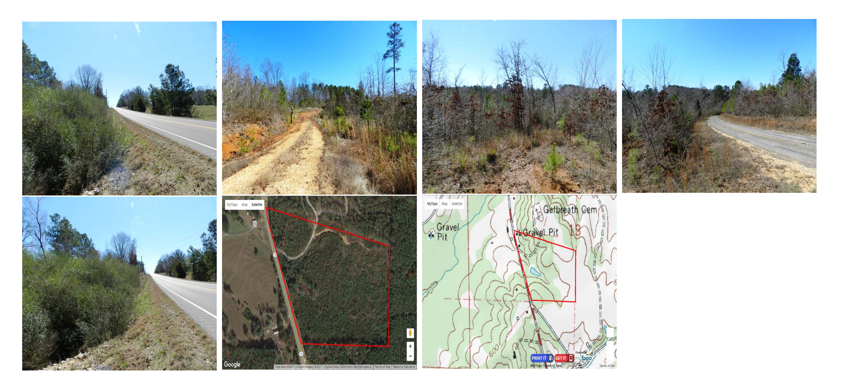
33.40 Acres Marion County GPS 34.1908 X -88.0683