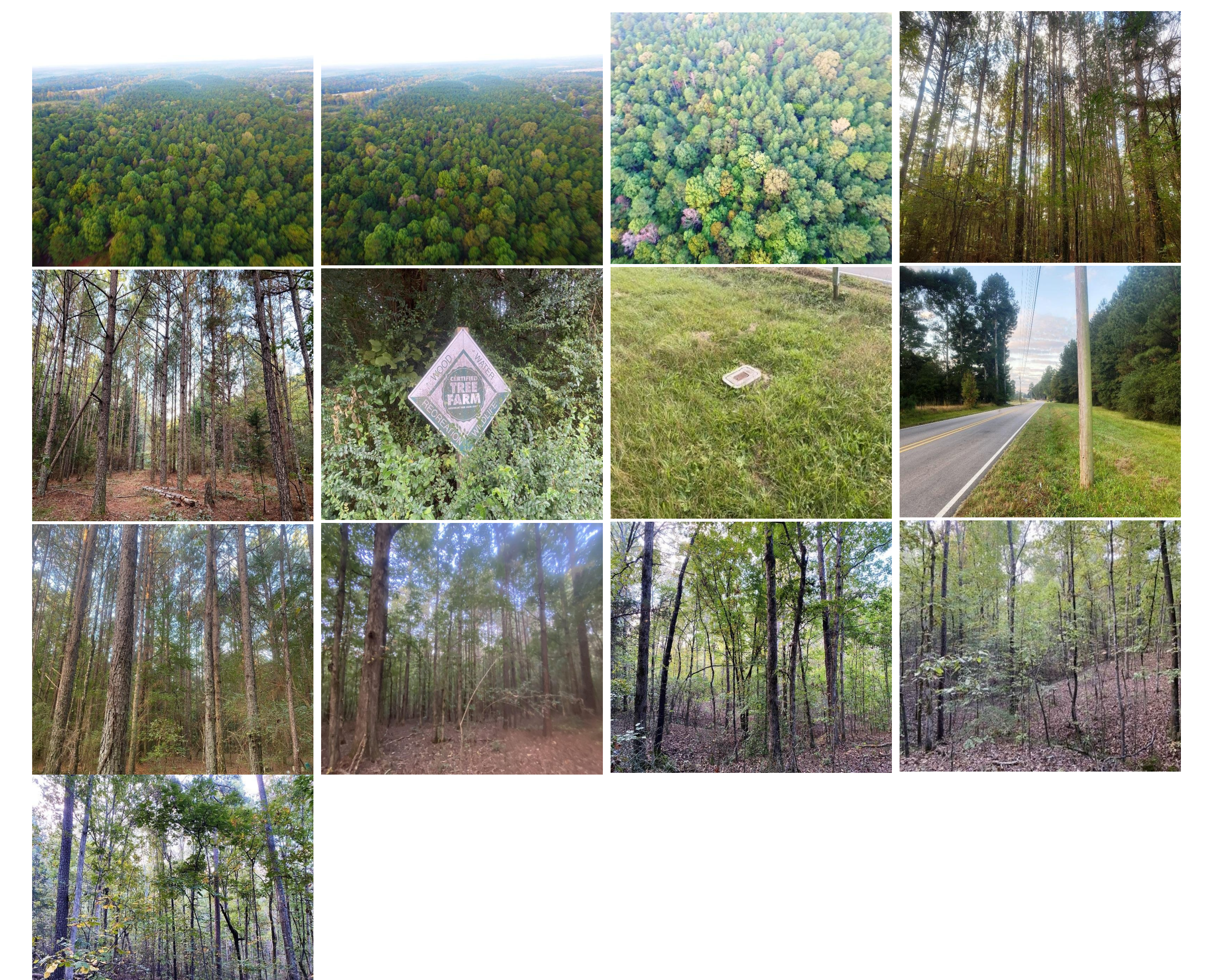
112.00 Acres Alcorn County GPS 34.8888 X -88.4458

Mossy Oak Properties Southeast Land & Wildlife www.selandandwildlife.com