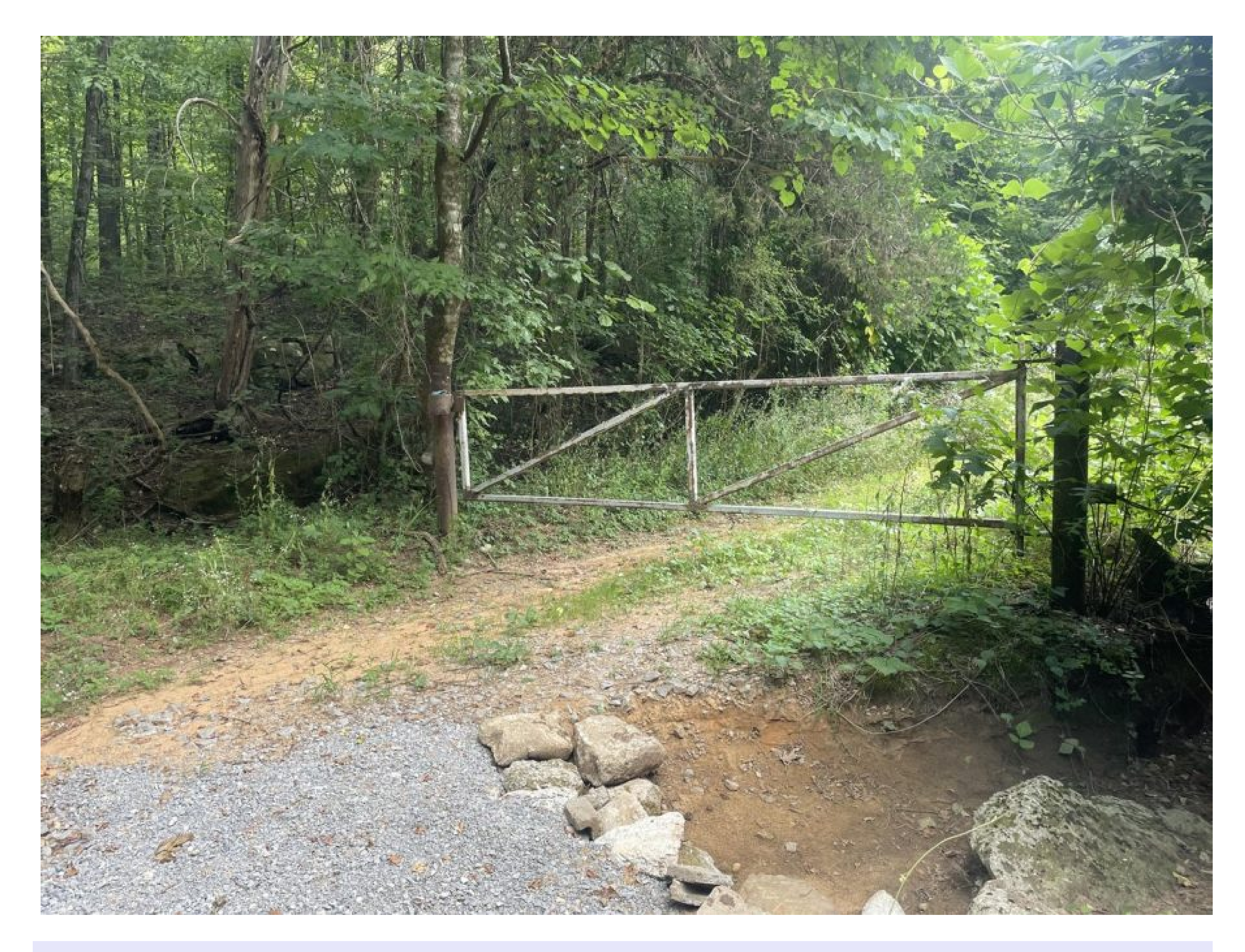
545.00 Acres Marshall County GPS 34.5126 X -86.5593