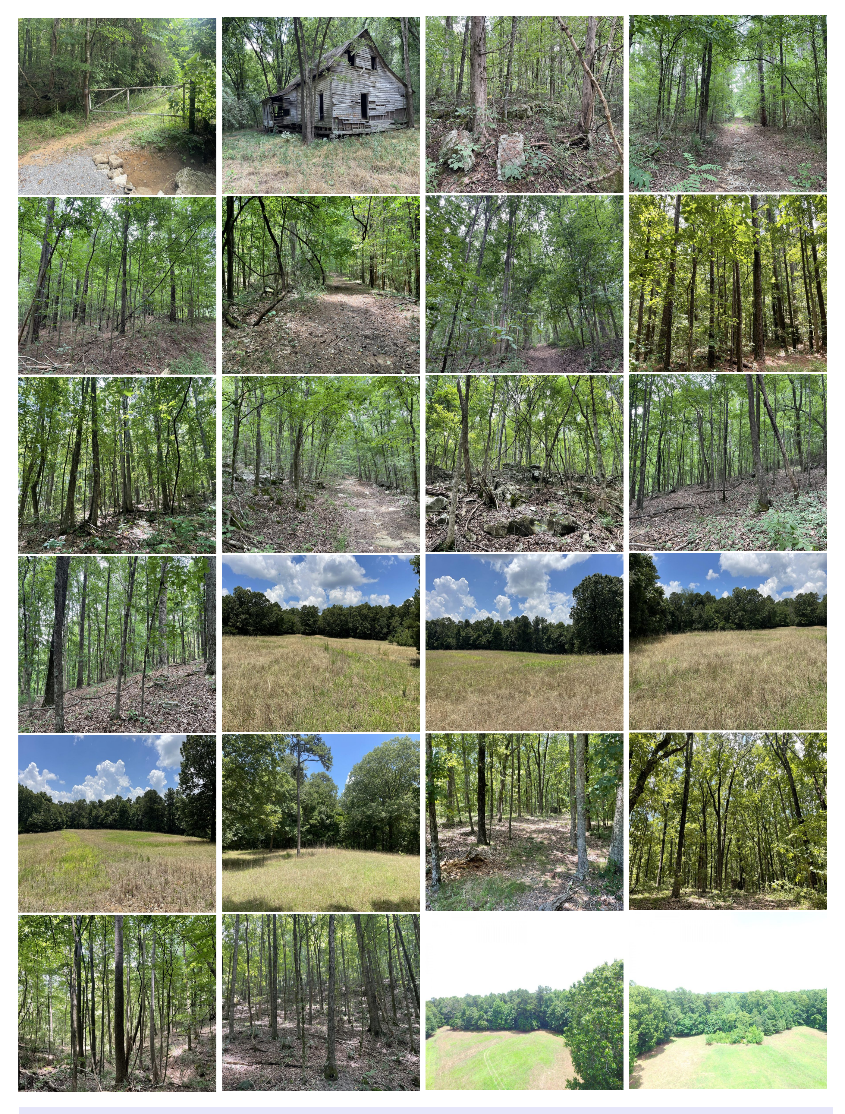
545.00 Acres Marshall County GPS 34.5126 X -86.5593