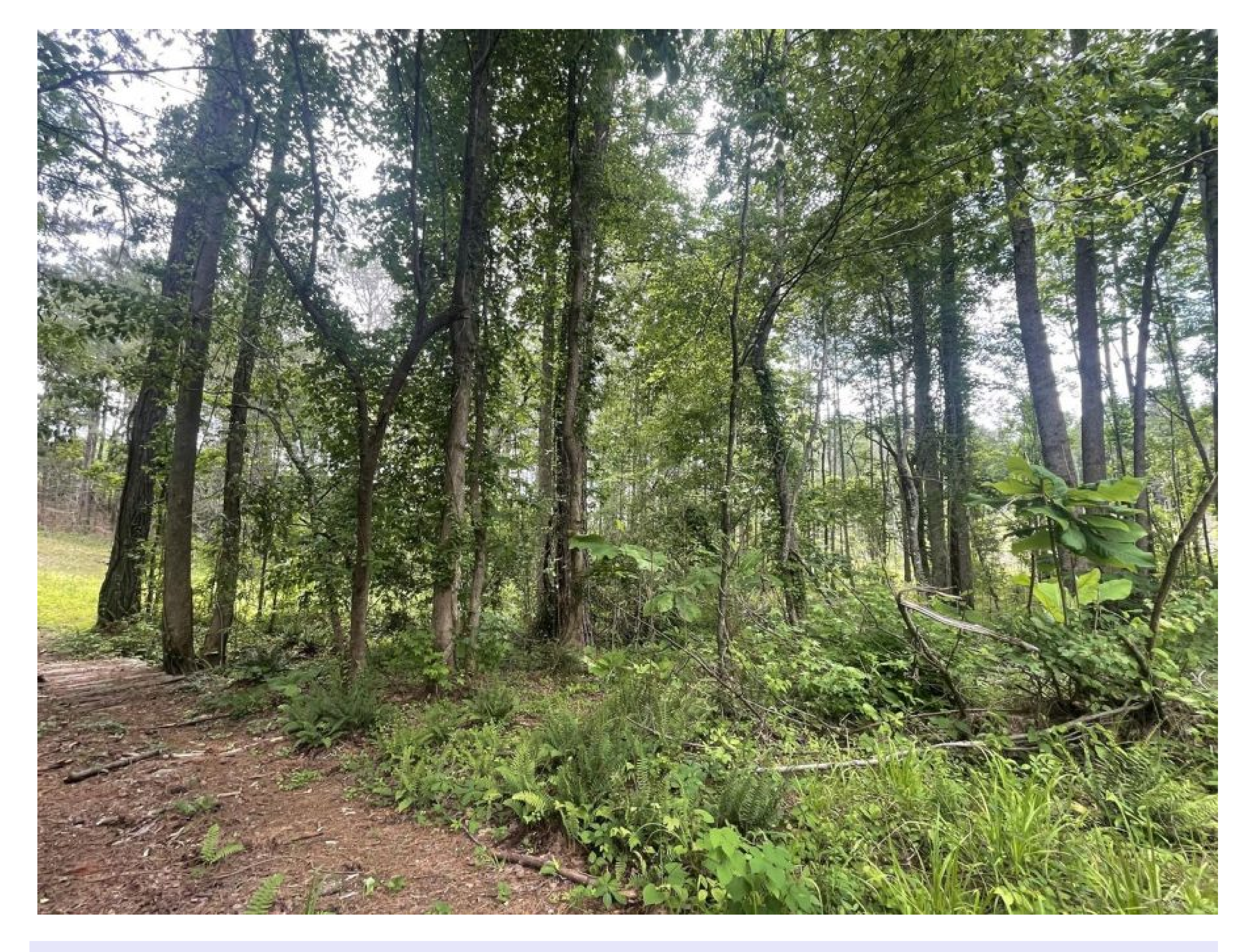
80.81 Acres Marion County GPS 34.202 X -87.726