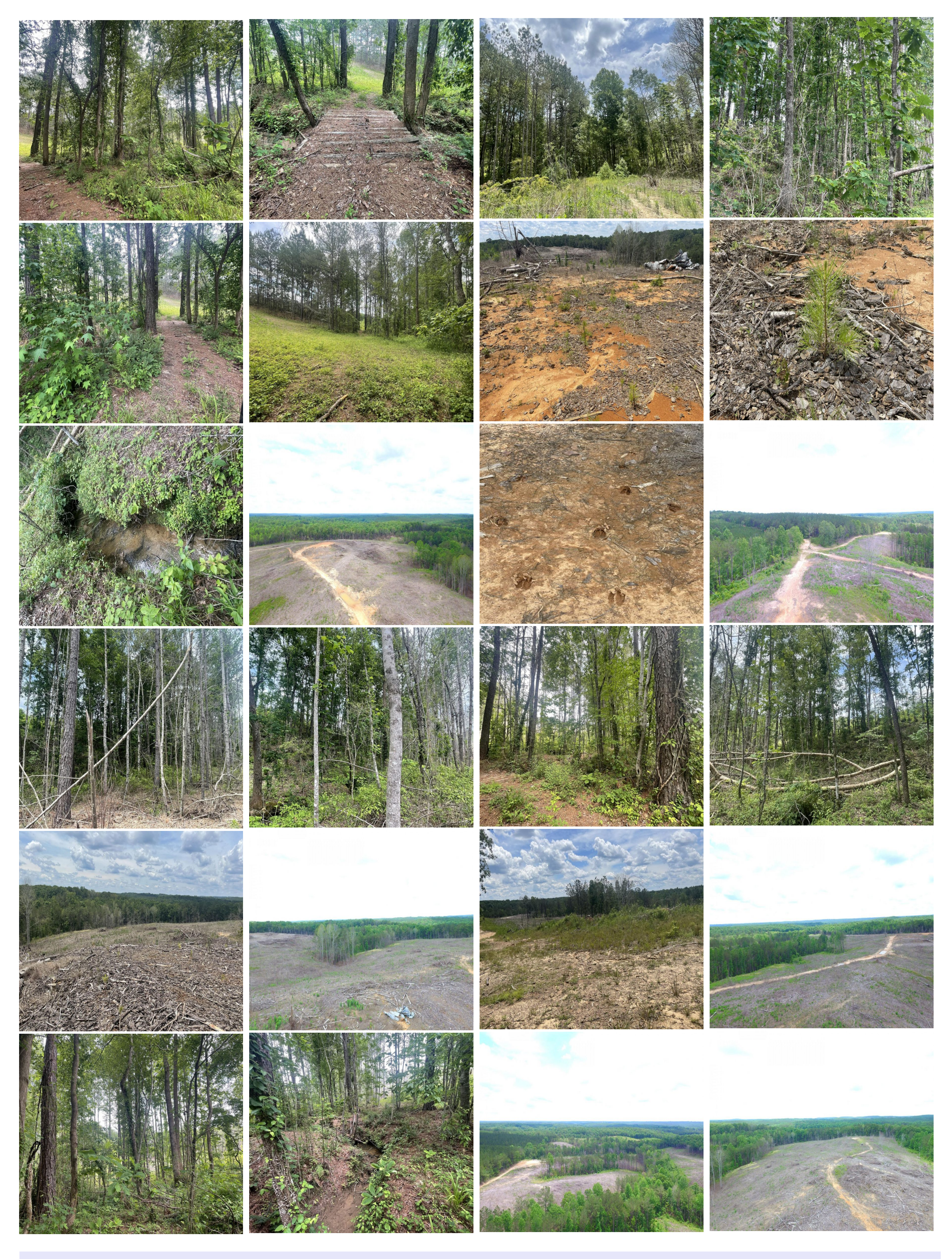
80.81 Acres Marion County GPS 34.202 X -87.726